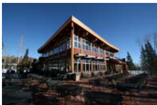
Red Pine Lodge