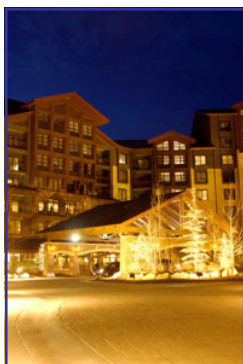
Grand Summit Hotel

We have confirmed a special hotel rate listed in the table below for this conference. Attendees should make their reservations by calling The Canyons® Resort directly at 888-CAN-YONS (226-9667) . Be sure to mention that you are with the National Association of Boards of Pharmacy group to qualify for the special group rate when making your reservations. To ensure accommodations, reservations must be received by The Canyons® Resort no later than Sunday, August 3, 2008 . Reservations made after this date will be subject to availability and prevailing rates.