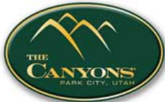
Logo Copyrighted by and used with the permission of The Canyons® Resort, Park City, UT